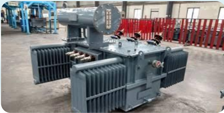
Principal SOUTH CHINA ELECTRIC CO. LTD., China