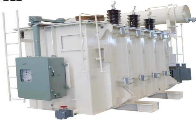
Principal SOUTH CHINA ELECTRIC CO. LTD., CHINA