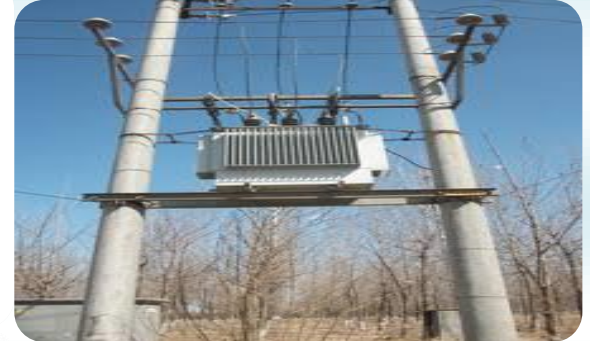
Principal SOUTH CHINA ELECTRIC CO. LTD., CHINA