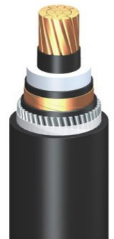
Principal BAOSHENG SCIENCE & TECHNOLOGY INNOVATION CO. LTD, China