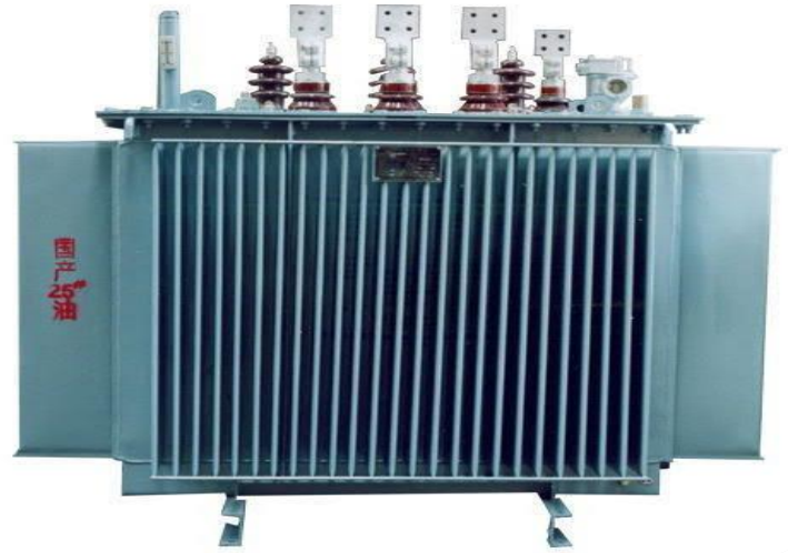
Principal SOUTH CHINA ELECTRIC CO. LTD., China