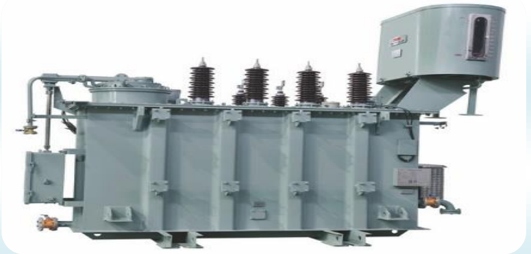
Principal ZHEJIANG JIANGSHAN TRANSFORMER CO. LTD. (JSB), CHINA