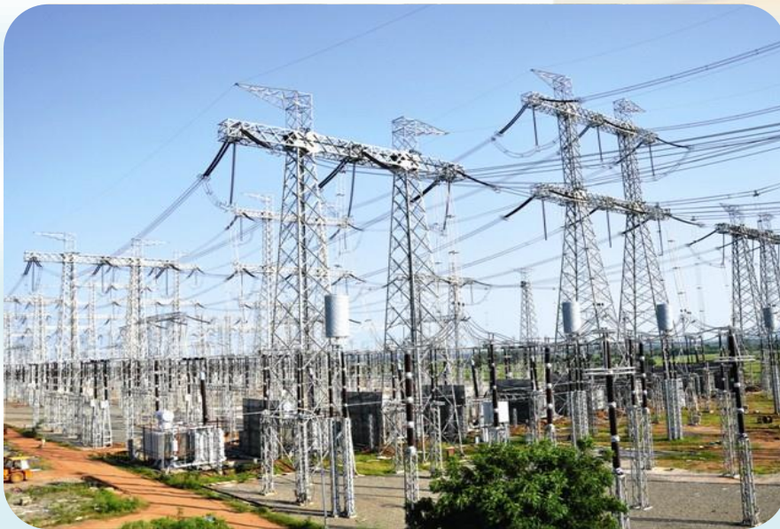
Principal CEC-FORTUNE JV, China