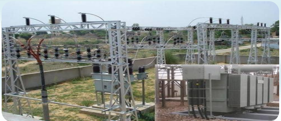
Principal CSR-SPTTC JV, China