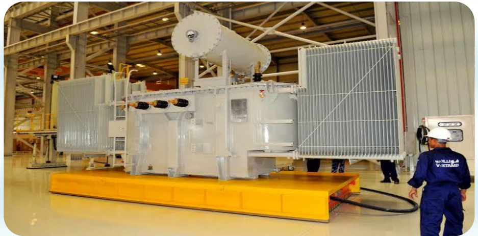
Principal SOUTH CHINA ELECTRIC CO. LTD., China