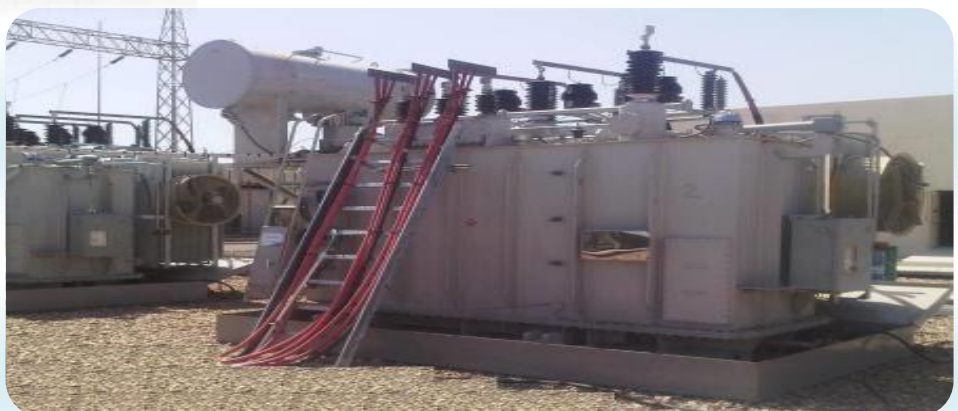
Principal ZHEJIANG JIANGSHAN TRANSFOEMER CO. LTD. (JSB), China