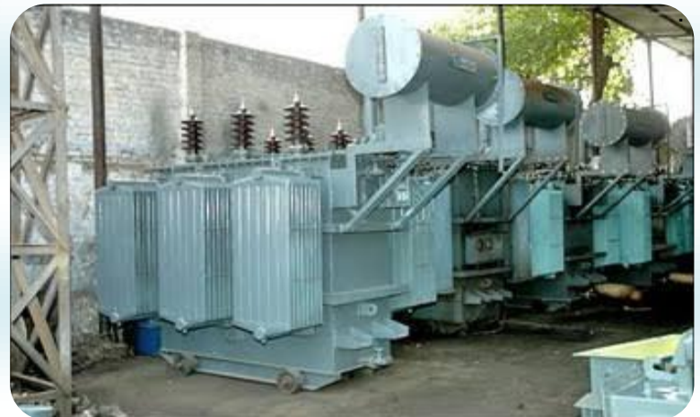
Principal SOUTH CHINA ELECTRIC CO. LTD., CHINA